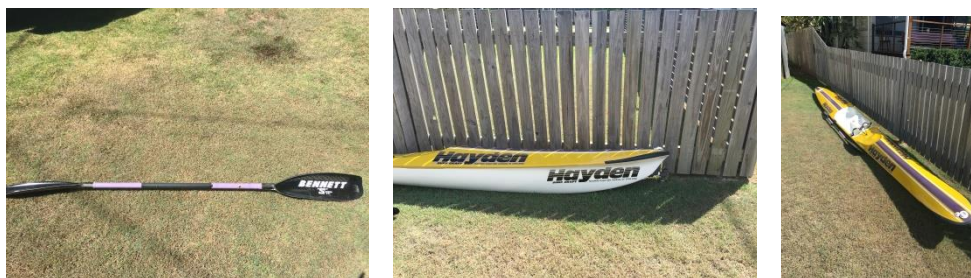
Non adjustable ski for sale, $350 with the paddle.

Contact Details: Emily Maguire, 0457419747