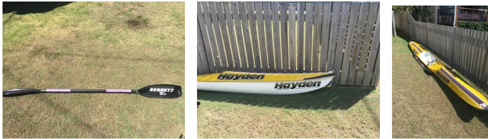
Non adjustable ski for sale, $350 with the paddle.

Contact Details: Emily Maguire, 0457419747