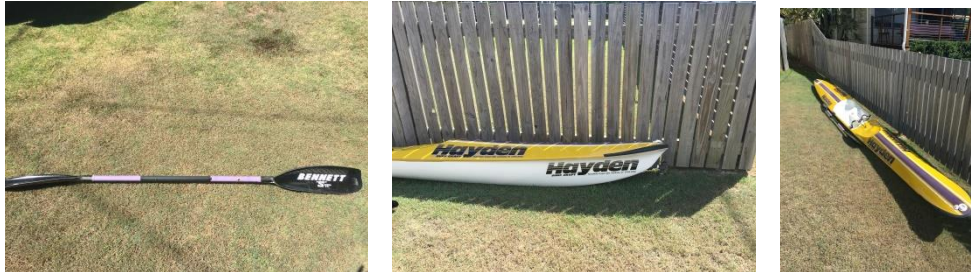
Non adjustable ski for sale, $350 with the paddle.

Contact Details: Emily Maguire, 0457419747